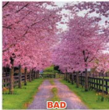
The trees are too low and narrow.

*Note no object or structure can make contact with a restroom trailer including trees, branches, vegetation, power lines, site equipment, ladders, tents, awnings, signs etc.