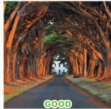
Good height and width clearance & drivable road.