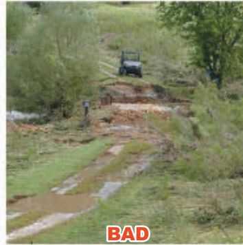
Slippery Jeep trail requiring 4wd & creek crossing.